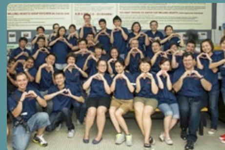
Distributing food at Willing Hearts

You will be provided with a Sands ECO360 Impact Statement highlighting total energy and water consumption, recycling rate, carbon emission and highlights of your sustainability initiatives.