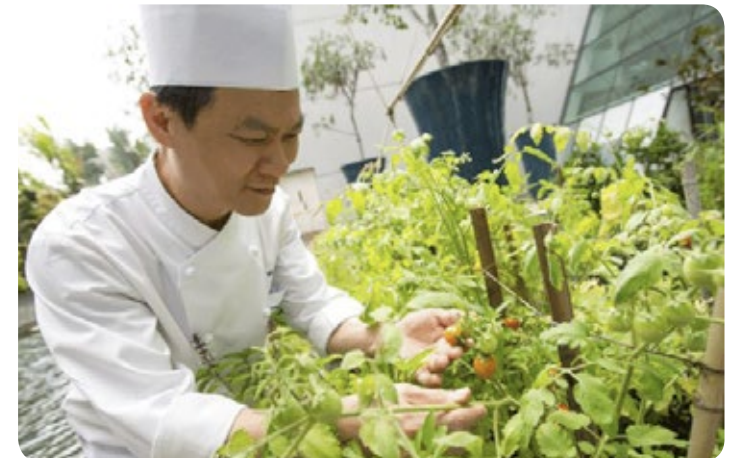
Harvesting fresh herbs from Marina Bay Sands' Herb Garden.

Our sustainable practices are already seamlessly integrated into our daily operations, adding value to your events at no additional cost to you.