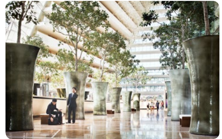
Chongbin Zheng, Rising Forest, 2010

As an integrated resort, we have everything under one roof. Sands® Expo is only a 5-minute walk from the hotel and with public transportation located conveniently inside, it will help you reduce your carbon footprint.